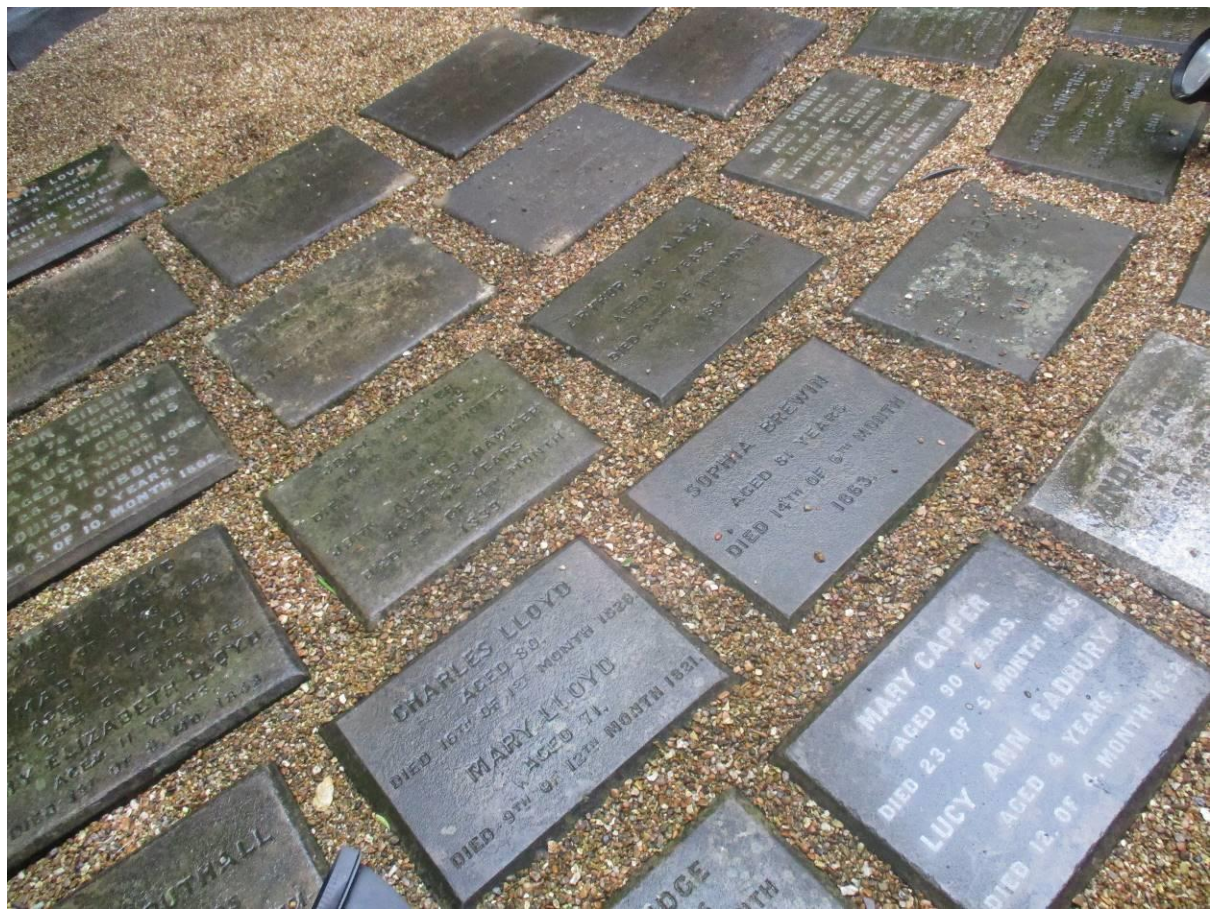
Figure 3: Plaques of those who were once buried at Bull Street